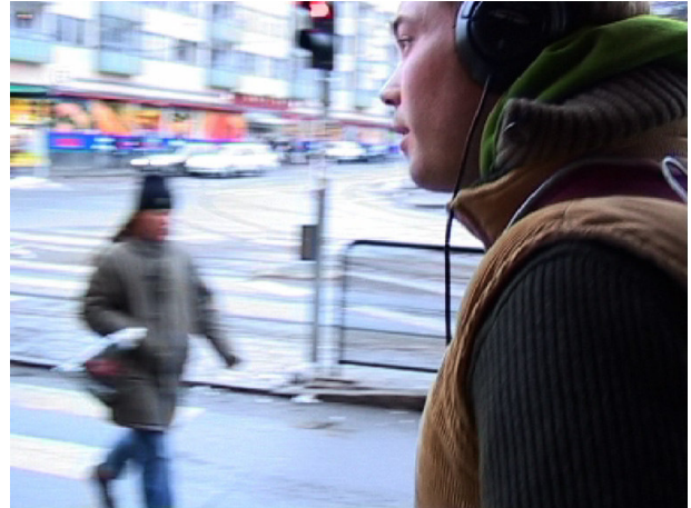
Figure 1: Sonic City user in action

The video show results from a short-term user study of Sonic City. We were interested in how people would use the system in real-world settings. We conducted a study of the system, where 5 participants used the prototype in 5-20 minutes long sessions. The study also included cultural probes, in-depth interviews, and other