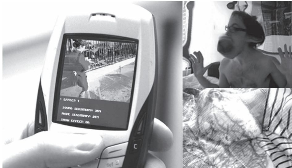
Figure 1. Context photography implemented on a camera phone (left), photographs with visual effects created by sound and motion in the moment of taking pictures.

photograph, than if it had been taken in a quiet setting. Context photography thus differs from Audiophotography (Frohlich et al. 2000) in that sound and movement are visually affecting the appearance of a picture in real time, rather than being associated as an audio or motion clip with the still image.