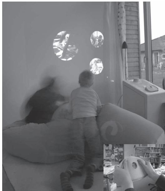
Figure 3. Squeeze. Pictures are taken through squeezing the camera; the pictures on the wall can be explored through physical activity in the chair.

Squeeze is an oversized interactive sack-chair which is intended as a site for collective and playful exploration of the history of the home as captured through the digital photos taken with a house camera (see Figure 3).