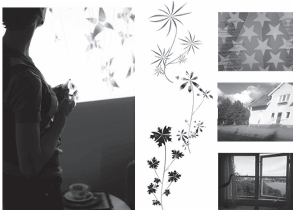
Figure 2. Autonomous wallpaper lets users place pictures from their camera phone on their living room wall. Each picture becomes a unique flower, growing dynamically with other flowers on the wall.

Autonomous wallpaper combines picture taking and home decoration (Ljungblad and Holmquist 2007). It introduces picture taking as a playful way to actively contribute to changing the interior design in the home. People can take pictures of everyday things with their mobile phones, send the pictures to the application, and let the colours and patterns in the images be transformed