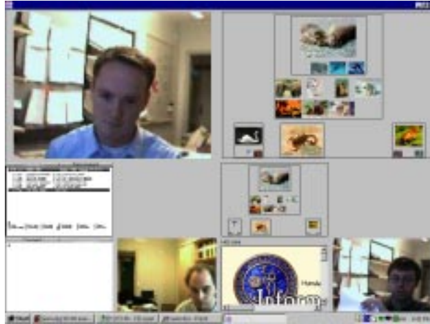
Fig. 4. The Focus + Context Desktop, incorporating several different applications.

framework allowed us to construct some novel combinations of first- and second-level information visualizations. We also described some work with a general software package based on the formal framework, including example applications that uses hierarchies of focus+context visualizations and multiple underlying visualizations.