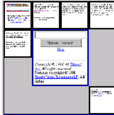
Fig. 3. The WEST Browser allows for several different views of the same web-page source.

used as complementary structures of the webpage in [IV]. Thus, the pre-processing delivered three sets of [IV]: one based on the graphical look of the cards, one based on the extracted keywords and one based on the links.