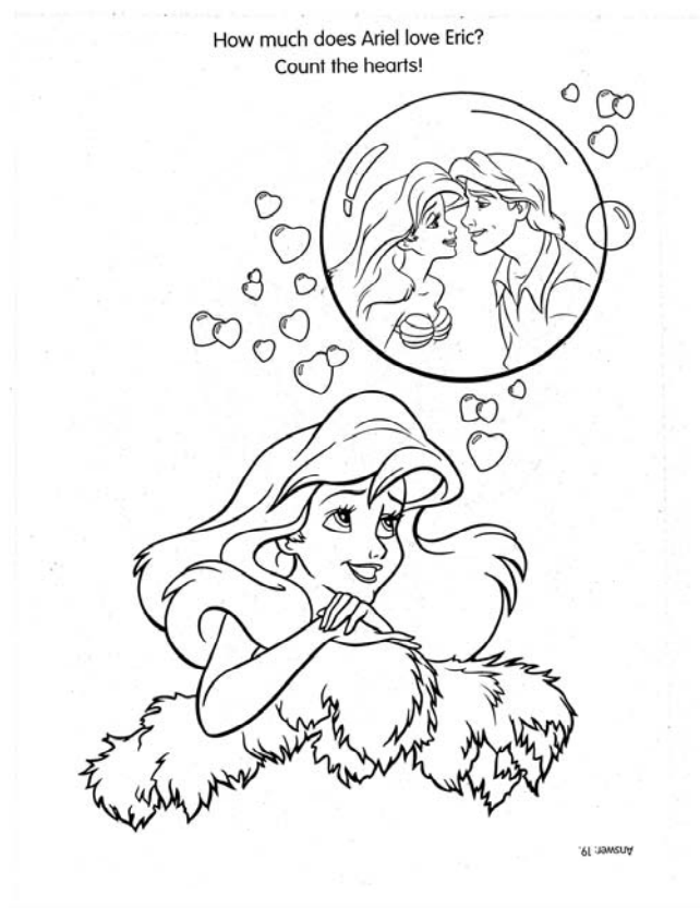
Figure 1. Measuring intimacy: Ariel loves Eric 19 hearts.

My recent work has involved building systems for communicating intimacy between couples in long distance relationships. This has a number of difficulties: we don't know how to measure intimacy, we don't know how to communicate intimacy, and we don't know how to measure if or how much intimacy we're transmitting. All of these make it difficult for to evaluate these systems. Figure 1