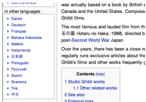
Figure 2: Links to pages devoted to the same topic in other languages.

concepts or entities that have entries in Wikipedia, and we will represent sentences by entries from this lexicon: an entry is used to represent the content of a sentence if the sentence contains a hypertext link to the Wikipedia page for that entry. Sentence similarity is then captured in terms of the shared lexicon entries they share. In other words, the similarity measure that we use in this approach is based on “concept” or “page title” overlap. Intuitively, this approach has the advantage of producing a brief but highly accurate representation of sentences, more accurate, we assume than the MT approach as the titles carry important semantic information; it will also be more accurate than the MT approach because the translations of the titles are done manually.