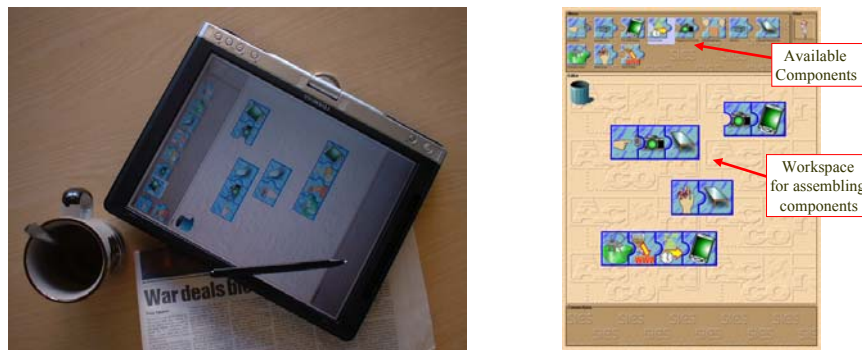
Fig. 1. The tablet editor and the editor screen

The Jigsaw editor is made available to users using a tablet PC that uses 802.11 to talk to the dataspace (see Fig. 1). The editor discovers the dataspace and is notified of the components available within the dataspace. The editor is composed of two distinct panels, a list of available components (shown as jigsaw pieces) and an editing canvas. Jigsaw pieces can be dragged and dropped into the editing canvas or workspace. When a jigsaw piece is dragged onto the workspace it clones itself and becomes a symbolic link to the underlying component it represents. The editing canvas serves as the work area for connecting pieces together and visualizing their activities.