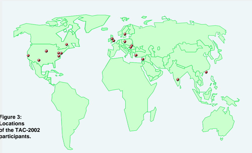
Figure 3: Locations of the TAC-2002 participants.

with trading agents, and the Information Server, for managing participants, games scheduling, and collecting and distributing game information and statistics via the Web and game monitoring applets.